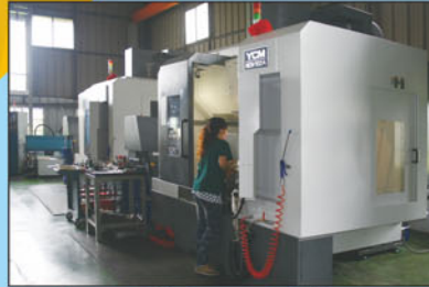
▲ Max. CNC machining travel: 1000 x 800mm